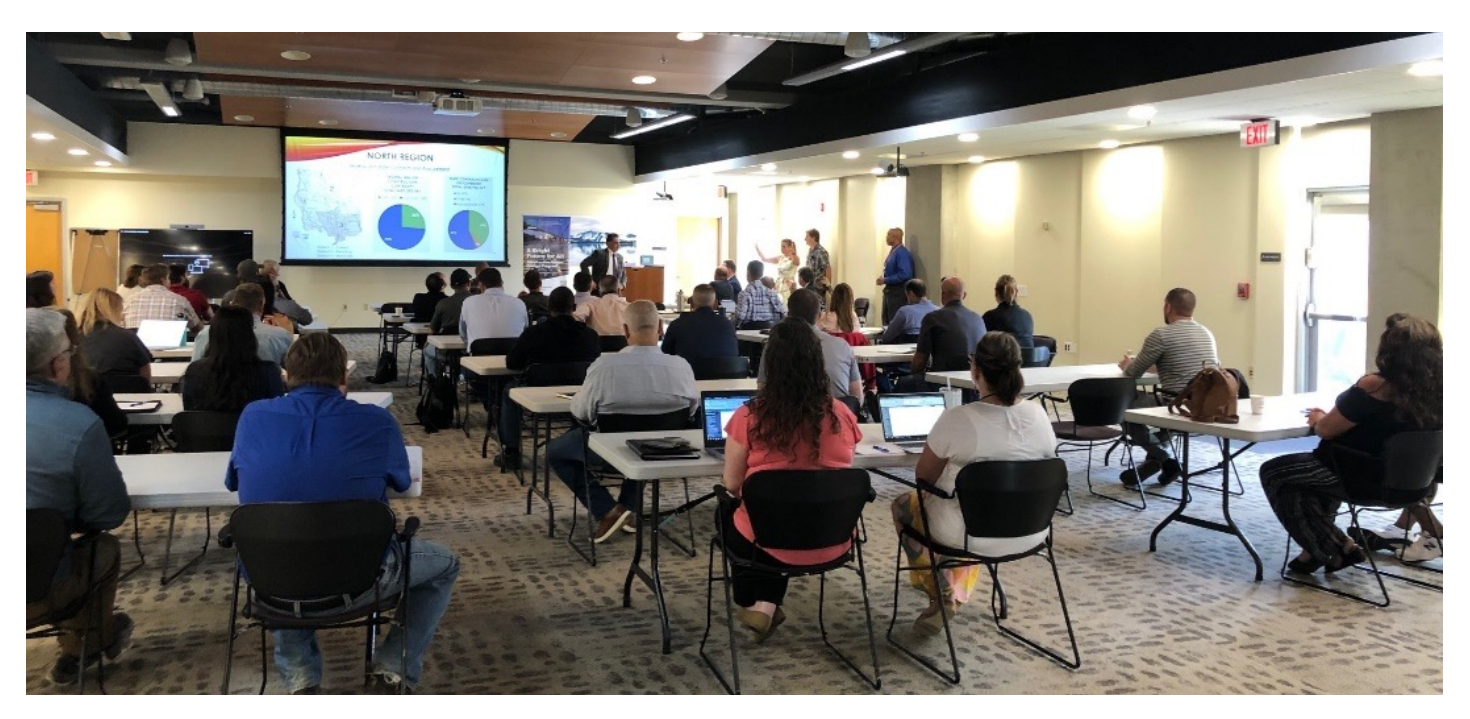
CMPP North Region Workshop 1 in Marysville, CA included a packed room of participants from Caltrans staff, CPM Logistics, and CMPP Mentors and Protégés.

he California Department of Transportation (Caltrans), with consultants from CPM Logistics, recently kicked off its statewide Construction Mentor Protégé Program (CMPP). Seven mentors from the construction field will join 16 small business protégés for a 6-month voluntary program to network and help each other grow their businesses. The goal of this statewide program is to assist small construction businesses with learning how to successfully bid and/ or complete Caltrans public works projects.