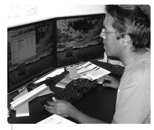
CMEA grants enable students to have the latest computer systems and software.

California State University, Chico receives the highest distribution since it has the largest CM program in the state (and one of the largest in the nation) with 715 students. The university received $67,000 from CMEA in Fiscal Year (FY) 2004/05, and $81,409 in FY 2005/06. Compared to figures in the overall university or state budget, it may seem insignificant, but it does make a difference.