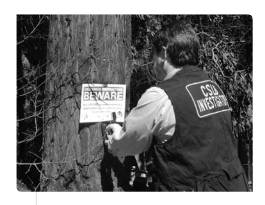
CSLB Enforcement representatives post signs throughout burn areas reminding consumers to "Look for the License" and warning unlicensed operators that working in a declared disaster area without a license is a felony.

Early outreach sent a strong message during last year's fire season. CSLB did not receive a single complaint from victims of either the Angora Fire near South Lake Tahoe, or the various Southern California wildfires.