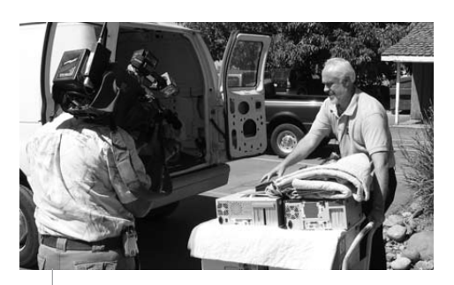
Computers and records from the Aquarius business office were confiscated as part of the investigation.

The CSLB and Sacramento County District Attorney's Office investigation of Imperial Pools (dba Aquarius Pools) of Sacramento (License #267176) began after the company abruptly halted operations in August 2006, leaving more than 60 families with partially completed swimming pools. CSLB received initial complaints and inquires from homeowners and subcontractors who filed more than 60 mechanic's liens against the homeowners for unpaid work.