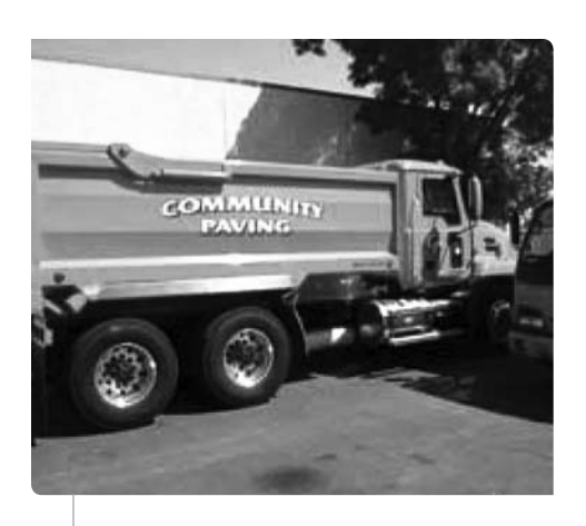
Pictured above is one of the many utility trucks believed to be used by George Stanley.