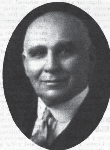
FRANK F. MERRIAM Governor of California

Progressive administration in conducting the affairs of the board has been evidenced in many ways. Another indication of this forward movement is their decision to have the Registrar publish a quarterly